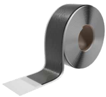
BLACK BAND page 144